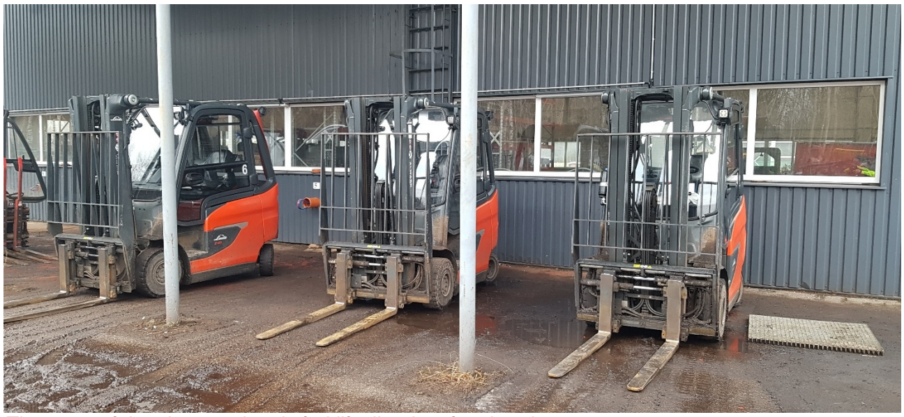
Three out of the six new electric forklifts lined up for charging.

An extra feature increases safety as the new forklifts are installed with a monitoring and warning system: pedestrians in the work area wear special safety vests, and when the forklift detects pedestrians or other forklifts nearby, it gives a warning signal to avoid collision. This automatic communication between employees and equipment reduces hazardous situations and is a great tool in our efforts to continuously reducing the number of work-related injuries.