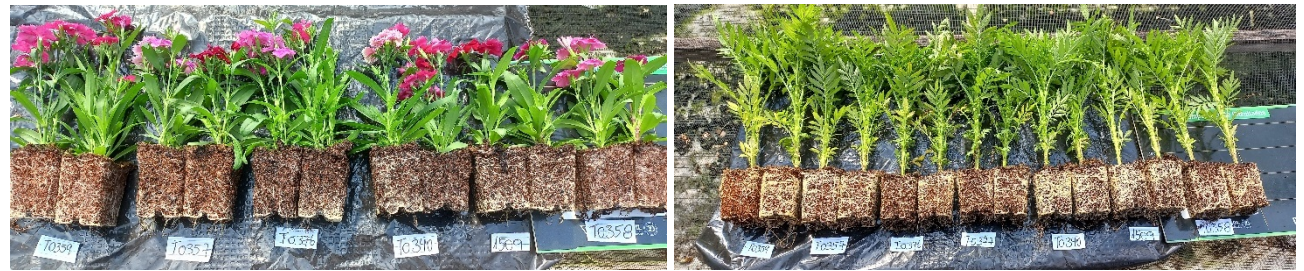
Thorough testing in close cooperation with customers is key to ensuring a smooth transition from one recipe to another.

We will maintain our focus on moving towards a lower peat ratio in our mixes, continuously introducing higher volumes of alternatives, particularly Forest Gold – wood fibre designed for use in horticulture. During 2024, our wood fibre production capacity is set to increase significantly, which will further support this development.